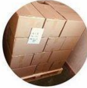
Load on pallet