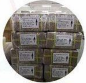
Wrapped Film and Tape