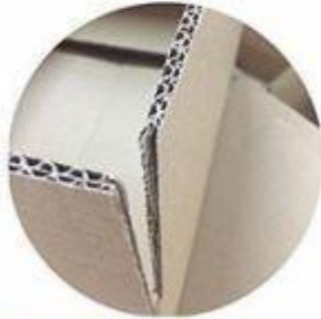
Double Layers Carton