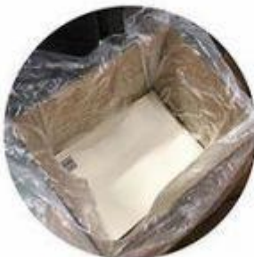
Water Proof Bag