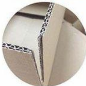
Double Layers Carton