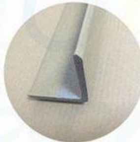
Strong Corner Protector