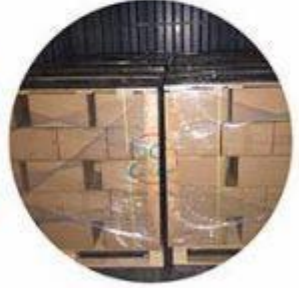
Wrapped Film and Tape