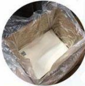
Water Proof Bag